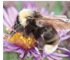
Gypsy cuckoo bumblebee

This large bumblebee once had an extensive range in Canada and was recorded in all provinces and territories except Nunavut. There has been a large decline in the past 20 – 30 years, and in 2014 the species was listed as endangered in Canada. It has not been found in Canada in recent years, and the last recorded sighting in Ontario dates back to 2008. The gypsy cuckoo bumblebee is a nest parasite of other bumblebees, including two species that are also in decline. Primary threats include the decline of these other "host" bumblebees, as well as pesticide use (particularly neonicotinoids) and pathogens from non-native bumblebees used in commercial greenhouses.