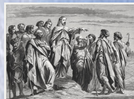
Lessons of the apostles