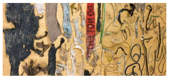
Display of 80 anthropogenic debris pieces found in a single nest

Birds • Habitat • Reduce Your Footprint •Wild Species