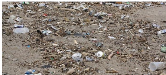
Lake Ontario plastic waste

Reduce Your Environmental Footprint What You Can Do - Avoid single use plastics - The Problem of Single Use Plastics